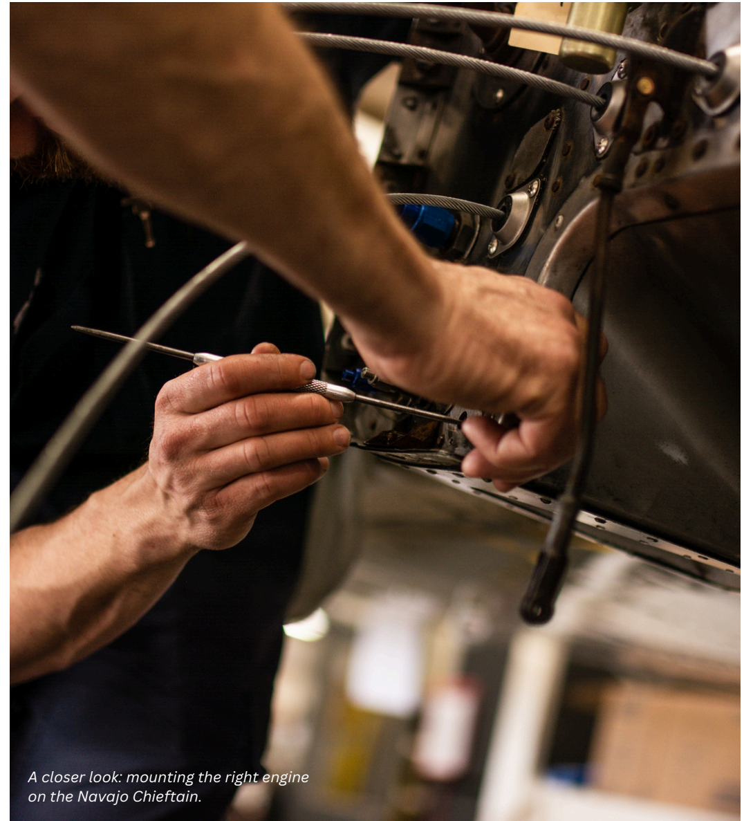
A closer look: mounting the right engine on the Navajo Chieftain.